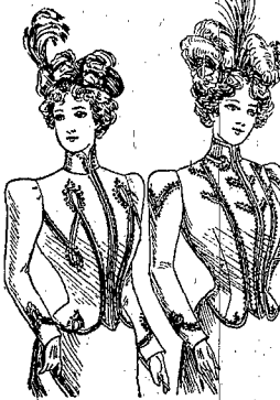
AS TAILOR BODICES ARE TRIMMED.

seize waist trimmed with narrow velvet braid was sketched for the above picture. It was open to the belt over a plique front, which showed in quite a smart waist fashion about the throat.