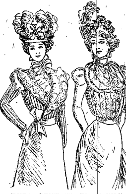
REPRESENTATIVES OF THE NEW CROW OF FANCY WAISTS.

New York correspondence. O many new fashions have been planned exclusively for the wealthy folk that it is a pleasure to note one that is well adapted to the purses of ordinary women.