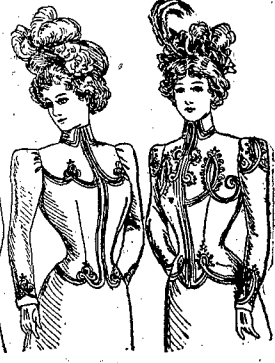
AS TAILOR BODICES ARE TRIMMED.

Never before were so many good weather-jackets, blouses and coats made with open cutaway fronts, showing waistcoats, plain tops, etc. of airy summer-like texture.