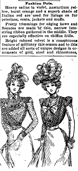
REPRESENTATIVES OF THE NEW CROW OF FANCY WAISTS.